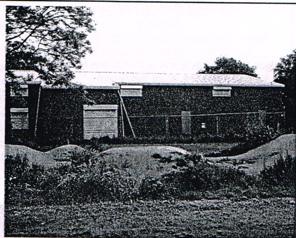
Above photo of the Poppy Centre A community building nearing completion Late summer

We have been busy appointing contractors to the project. We are pleased to advise that Bryn Williams continues as our main contractor with all the ground, brick and block work to complete the building as well as putting in the paths and back access road. We have appointed Brown and Payne as our main electrical and fire installation contractor, Anglia Heating as our plumbing, heating, ventilation and ground source contractor, The East Anglian Lift Company for our platform lift, Cooks Blinds and Shutters who have already provided us with the external doors and shutters and will be putting in a folding wall, Granwood Flooring Ltd for most of the internal flooring, and Midas Structural, who have already provided the steel structure, but will be installing the front canopy and fire escape stairway. Blockwork has been continuing to the inside of the building and the first fix of electrical and plumbing works has begun.